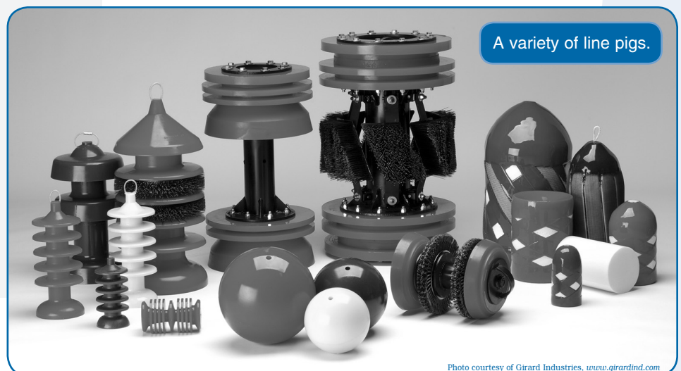
A variety of line pigs.

States and municipalities typically do not require regular pigging or swabbing of distribution lines in water systems. Some may only require pigging after initial construction of a new line to remove any debris left in the line because flushing alone will not always clean the dirt and debris out of the line.