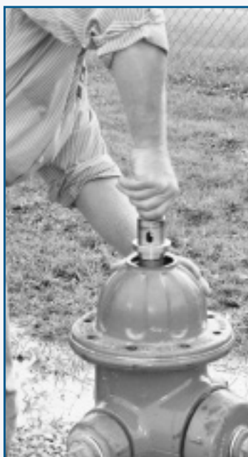
4. Remove the operating nut.