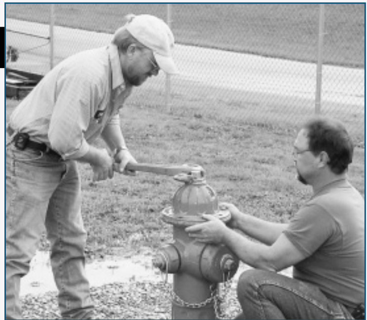
1. Loosen the hold-down nut.

However, tightening the caps too soon can trap water in the barrel and set up the possibility of freezing. As a matter of fact, because hydrants need a supply of air to drain properly, a good way to check the drain is to place your hand over an open nozzle