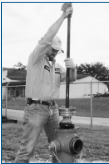
7. Lift out the entire valve, seat, and stem assembly.

after the hydrant is turned off. As the water drains it creates a vacuum that can be felt at the nozzle. So remember: never tighten the caps until the hydrant finishes draining. And never, ever operate a fire hydrant with any wrench other than the one designed for that particular hydrant.