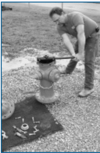
6. Use the manufacturer's seat wrench to unscrew the seat ring.