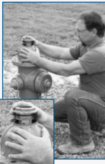
2. Remove the hold-down nut.