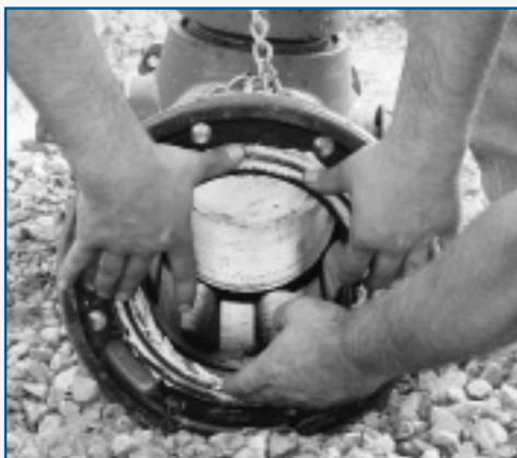
Install the safety flange O-ring.

As the hydrant is closed, the upper valve plate slides up and uncovers the weep holes, allowing the hydrant to drain. As the main valve is forced away from the seat ring, the upper valve plate moves down to seal off the drain.