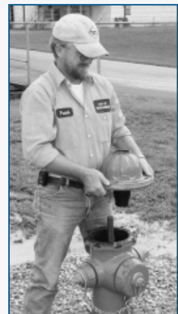
5. Remove the bonnet.