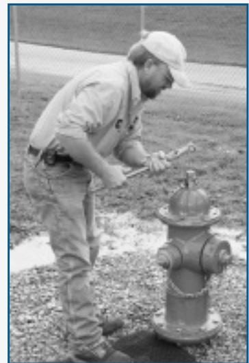
3. Loosen the operating nut.