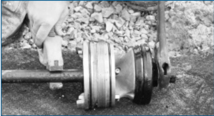
Dismantle the main valve, upper valve plate, and seat ring.

Valve stem with a safety stem coupling (A). This coupling, along with the safety flange and safety bolts & nuts (B), allow the hydrant to be broken off, as in a car accident, without causing the valve to be disturbed and water escaping.